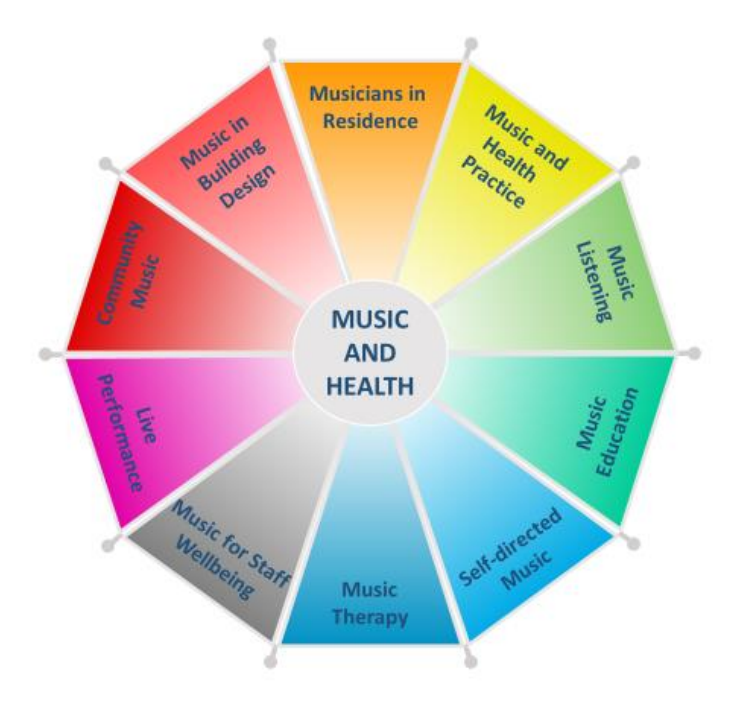
Figure 1: Music and health (Moss, 2016)

This paradigm aims to counter the artificial and defensive barriers constructed between practitioners and professional groups within the field, encourages greater respect and understanding between practitioners and assists in identifying training and development needs for the various arts professionals working in contexts related to health and well-being.